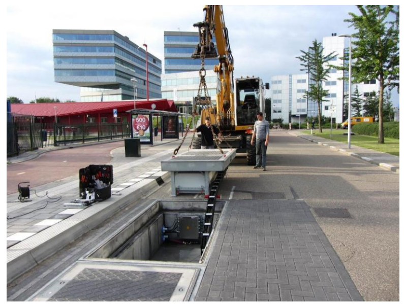
Caption: Installing a 60 kW charging module at a bus station with 120 kW charging capacity (Conductix-Wampfler)