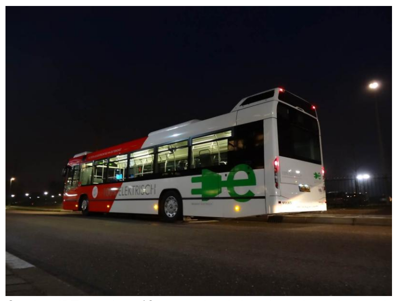
Caption: IPT permits a 12-metre electric bus three times the length of service (Conductix-Wampfler)