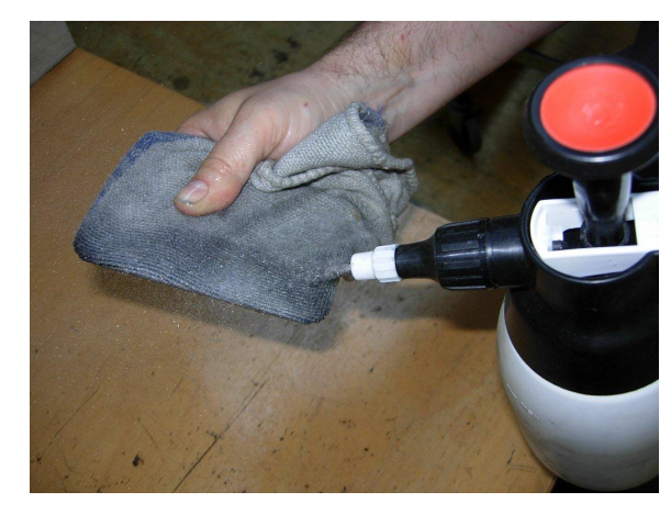
Figure 5: Moisten cloth

Wipe through the engagement slot of the conductor rail. This will loosen and absorb the dirt.