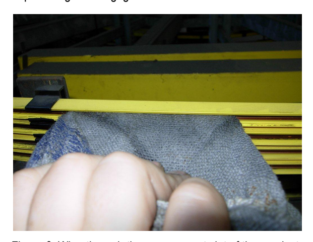
Figure 6: Wipe through the engagement slot of the conductor rail.

Wipe through the engagement slot of the conductor rail. This will loosen and absorb the dirt.