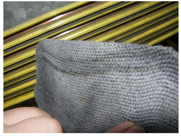
Figure 7: Absorbed dirt