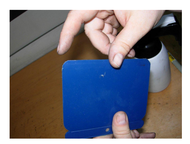
Figure 2: Spatula with rounded corners