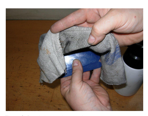
Figure 3: Put cloth over the spatula