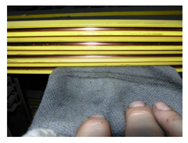
Figure 8: Clean all poles one after the other