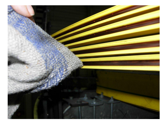
Figure 11: Angle for cleaning the lower area