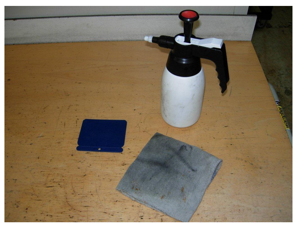
Figure 1: Tools (cloth, spatula and cleaner)