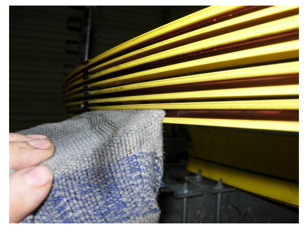
Figure 10: Change the angle of the cleaning tool in order to clean various areas