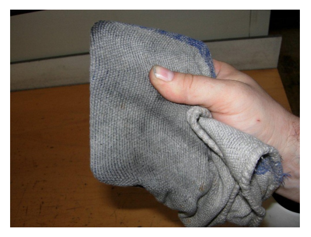
Figure 4: Cleaning tool